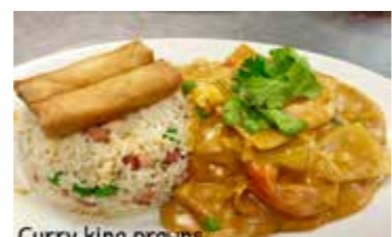
Curry king prawns