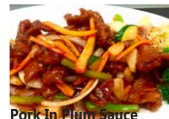
Pork In Plum Sauce