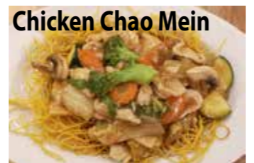
Chicken Chao Mein