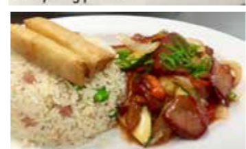
BBQ pork in plum sauce