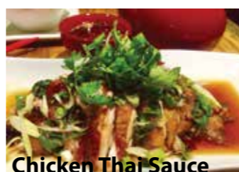
Chicken Thai Sauce