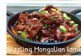
Sizzling Mongolian Lamb