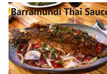
Barramundi Thai Sauce