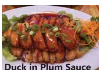
Duck in Plum Sauce