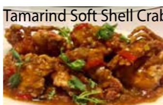
Tamarind Soft Shell Crab